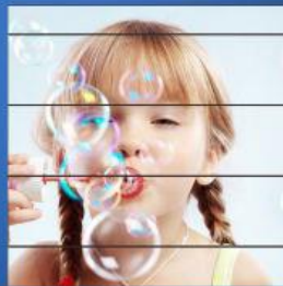
Low refresh rate