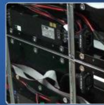
power supply and socket front maintain