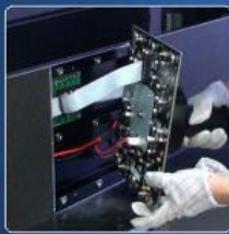
Magnetic tools aspiration

Complete front maintain, use the magnetic tools maintain.