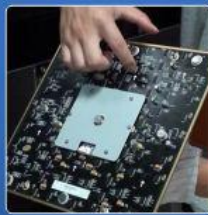
pay attention arrow direction