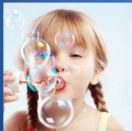
High refresh rate

High contrast ratio and high refresh rate ensure the framerate smooth and stable, high fidelity images and videos.