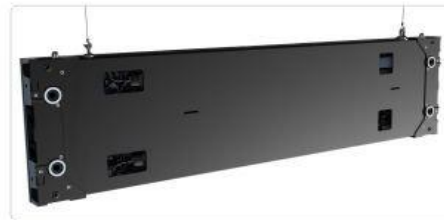
Module Hanging Installation