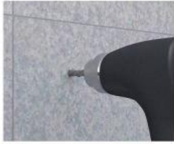
First punch on the wall

No need room to maintain, can be mounted on the wall, can be installed and maintained from front side, save 90% room compare with Traditional cabinet;