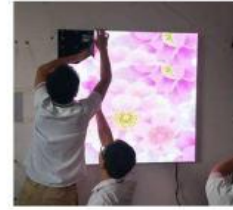
After installation Installed module