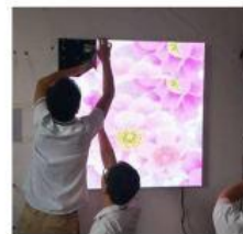
After installation Installed module