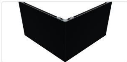
90° Module Hanging Installation

Right angle. Can make different shapes. Different cabinet sizes can meet the demands of different areas.