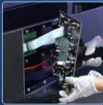
Magnetic tools aspiration

Complete front maintain, use the magnetic tools maintain.